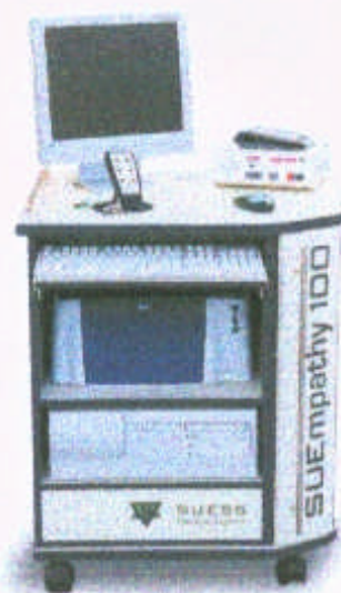
measuring point SUEmpathy 100

With psammotherapy, the origin of which can be traced back to the Middle Empire of Ancient Egypt, a worldwide applicable, efficient Arabic form of therapy is provided which culminates in the Imhota-