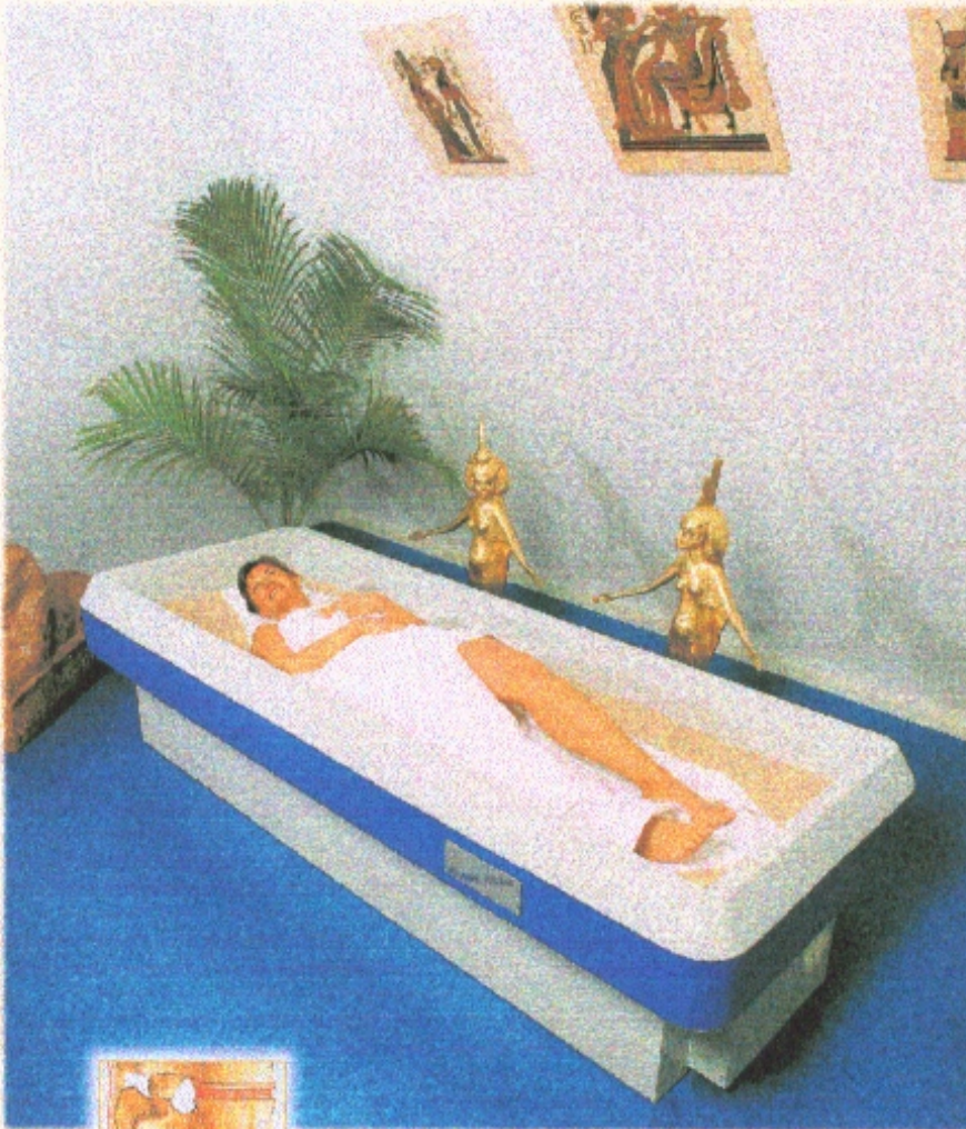
PSAMMO THERM medical sand bath

Ancient Arabic-Egyptian Medicine with temperate sand